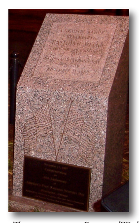
The monument to RaymondWeeks across from Boutwell Auditorium, dedicated 1989, with 60th Anniversary Commemorative Plaque added in 2007.