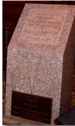
The monument to Raymond Weeks across from Boutwell Auditorium, dedicated 1989, with 60th Anniversary Commemorative Plaque added in 2007.