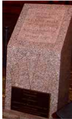
The monument to Raymond Weeks across from Boutwell Auditorium, dedicated 1989, with 60th Anniversary Commemorative Plaque added in 2007.