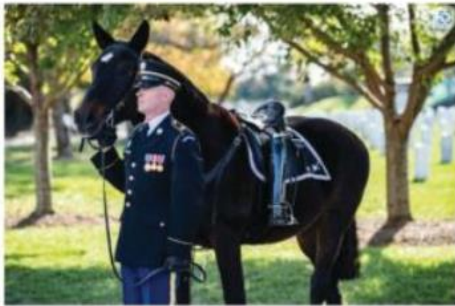
A caparisoned (riderless) horse and soldier from the 3d U.S. Infantry Regiment (The Old Guard) honor the late Gen. (ret.) Colin Powell during a special military funeral at Arlington National Cemetery, Arlington, Virginia, in 2021.

At the full military honors funeral for Gen. Colin Powell (USA Retired), Hank served as the caparisoned (riderless) horse, with boots backward signifying this warrior will not ride again.