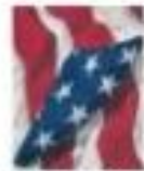
In Daddy's Honor