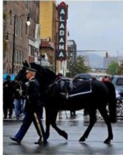
Hank the Tank is the first riderless horse from The Old Guard and Arlington Cemetery to walk in the Birmingham Parade.