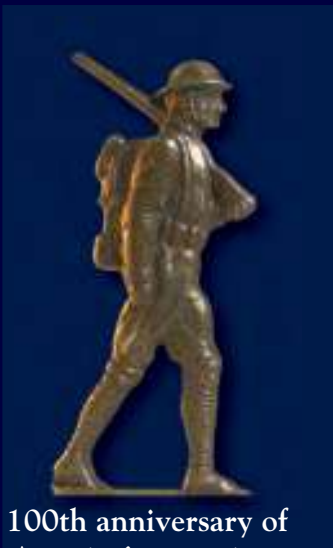
100th anniversary of America's entry into World War I

George Washington President of the United States