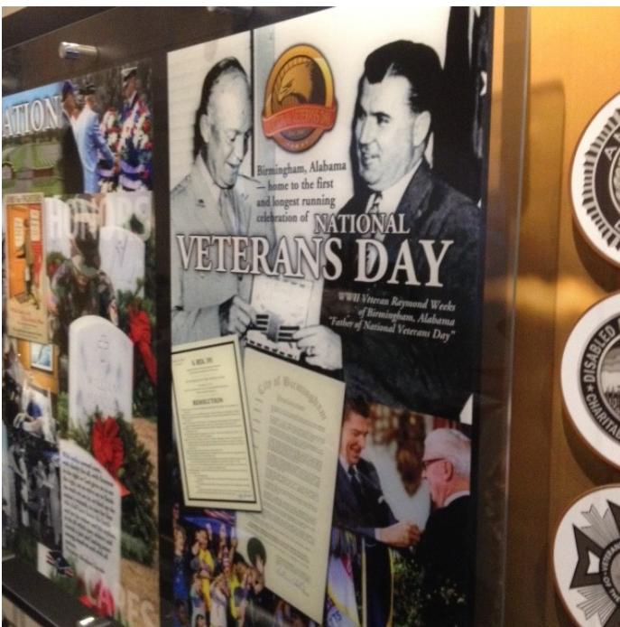
Veterans Shrine Display, The American Village

Teachers of millions of students in America can teach the who , where , and why National Veterans Day started—connecting history to character traits and plans for school & life to inspire patriotic action.