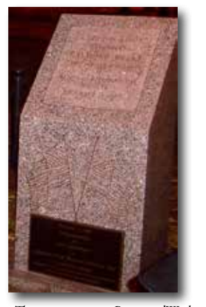
The monument to RaymondWeeks across from Boutwell Auditorium, dedicated 1989, with 60th Anniversary Commemorative Plaque added in 2007.