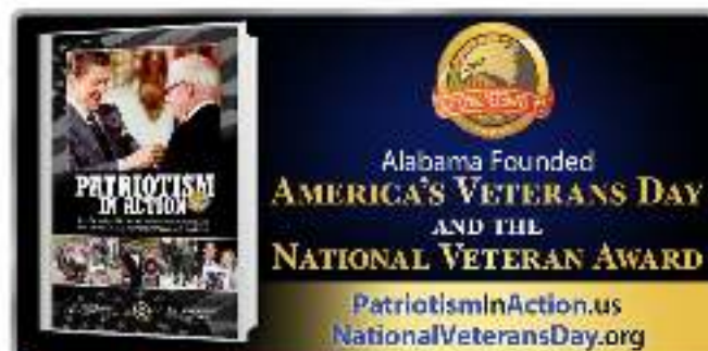
Billboard 2012 in three cities

C entral Alabama is a Top 5 historic destination for Veterans Day events.