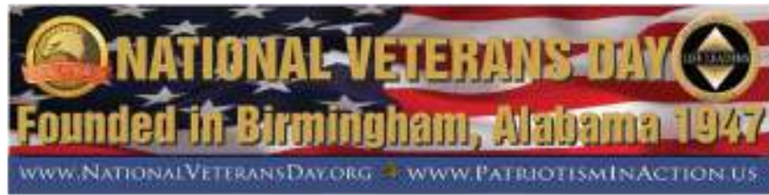
Parade Banner provided by Patriotism in Action of Life Leaders America 2014.

“The driving force...” -President Ronald Reagan- “Father of Veterans Day...” -Elizabeth Dole-